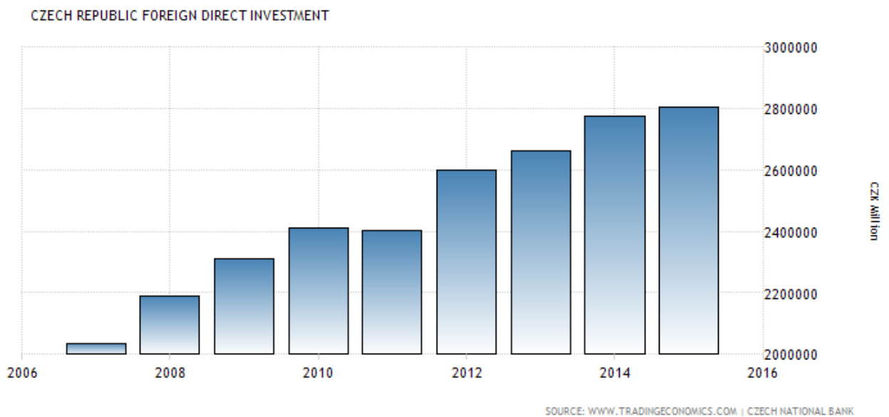
TABLE 3 Foreign direct investment

The most important investors are the Netherlands, Germany, Austria and Luxembourg. Sectoral structure of FDI in the Czech Republic remains relatively unchanged compared to the previous year. The largest recipient sector in 2015 was sector of real estate services, financial services and engineering. Data for 2016 are not published.